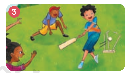
Is he playing baseball?