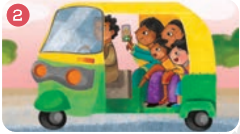
Are they taking a rickshaw?