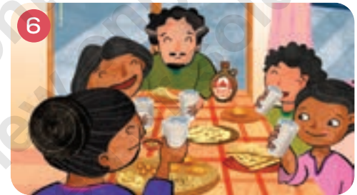
Are they drinking maple lassi?